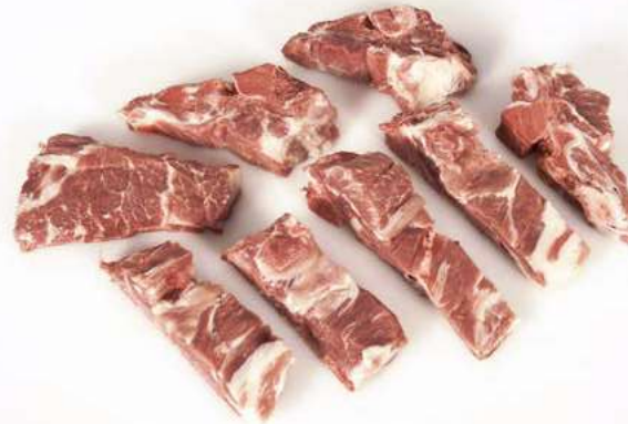
5 Cut/saw the bones into 30 mm wide portions.