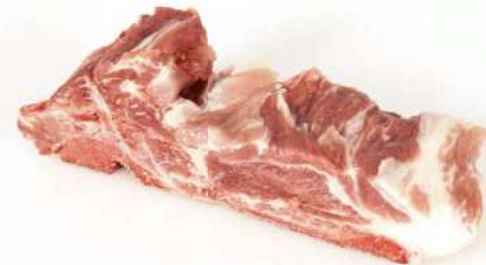
6 Derby Ribs.