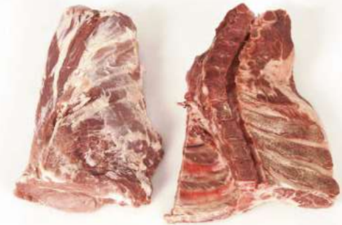
3 Remove the bones by sheet boning leaving a minimum of ...