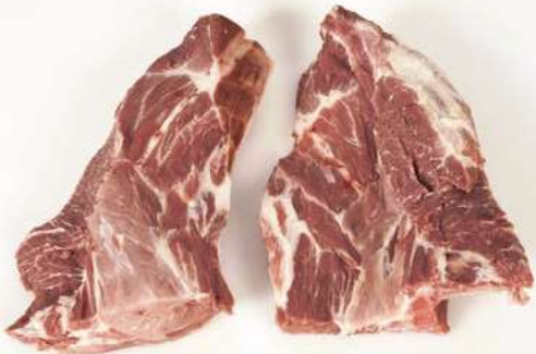
4 ... 20 mm of meat on the bones.