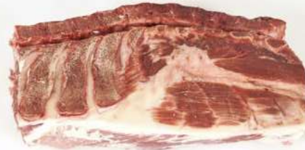
2 Collar of pork – bone-in.