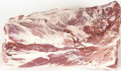
1 Collar of pork – bone-in.